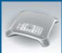
IP Conferencing Phone